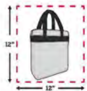
CLEAR BAG SIZE